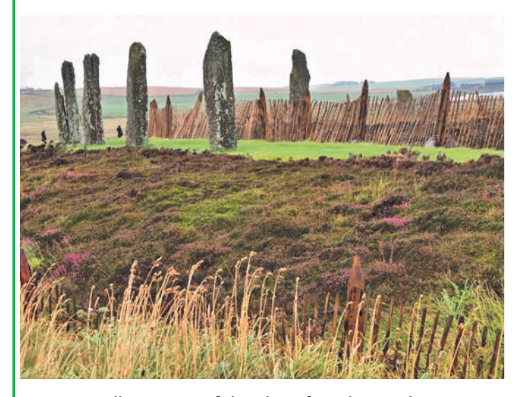
Standing stones of the Ring of Brodgar, Orkney.