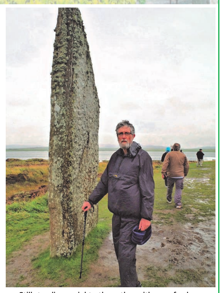
Still standing upright—the author with one of only 27 stones which remain standing. About 60 were originally erected.

Standing on the Ring of Brodgar I wondered how my ancestors were subject to wars and invasions,